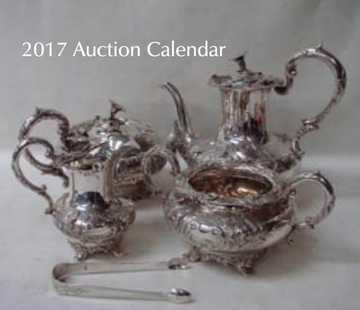
Silver Tea Service, £1500