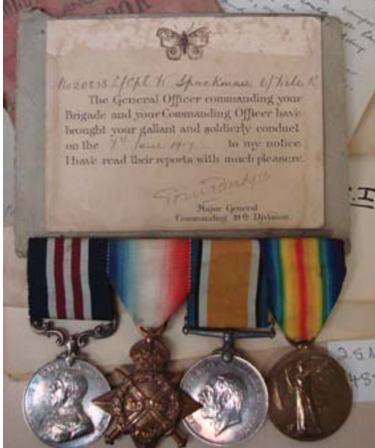
Great War Medals, £750

Note: Some items submitted for entry may be rejected for legal reasons or to safeguard quality of goods offered at auction. All items are subject to the auctioneer's approval. Please ask as we are always happy to offer advice and on alternative methods of disposal.