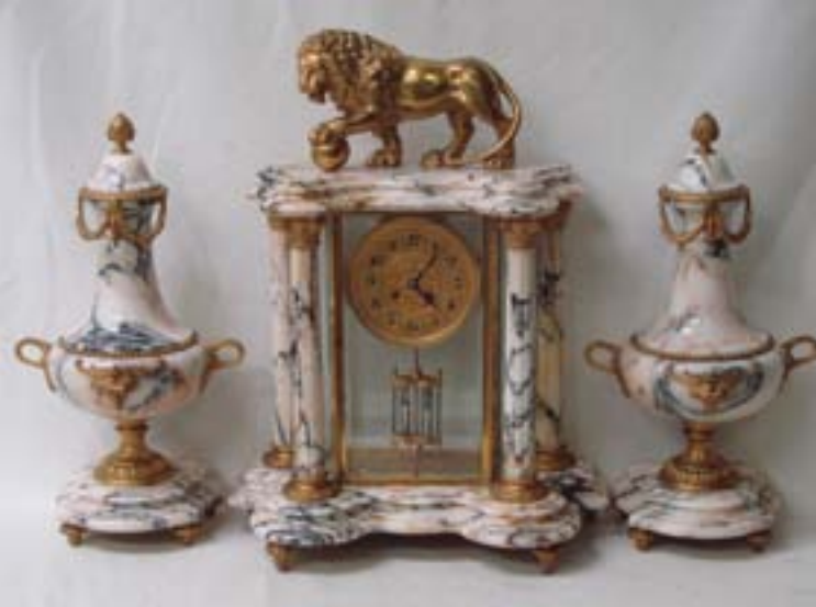
French Marble Clock Garniture, £950

Rural and Domestic Bygones auctions take place on Saturdays in January, March, May, July, September and November featuring unusual vintage items, curiosities, agricultural, railway, dairy and gardening antiques and collectables.