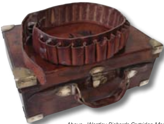
Above - Westley Richards Cartridge Magazine, £280 Right - Apothecary Jars, £220