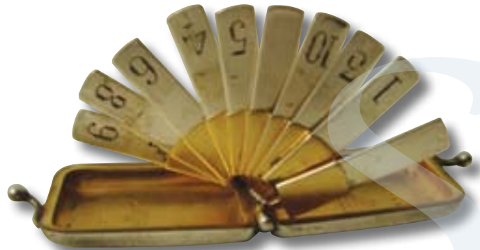
Edwardian Silver Butt/Peg Marker, £720