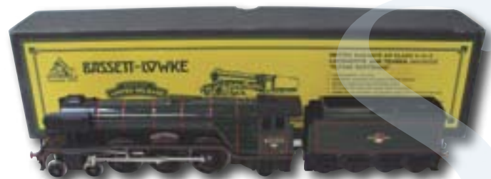
Basset-Lowke Flying Scotsman, £380 Front cover - Rolex Oyster Perpetual datejust, £6200

Silverwoods is proud of its policy to pay selling customers as soon as possible after the weekly sale – cheques are sent out immediately and received by our vendors in just a few days, and certainly no more than a week.